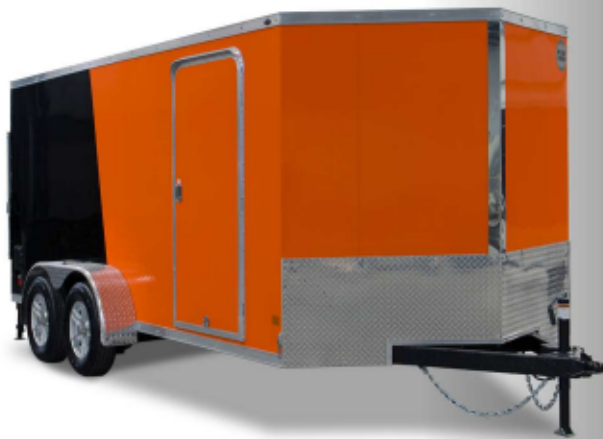
Shown with optional multi-color exterior.